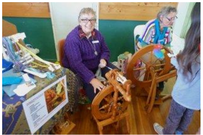
Wool Spinning –