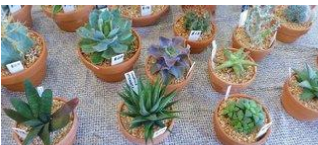
Cactus and Succulents -