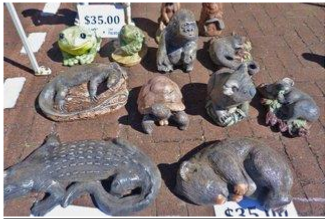
Garden Ornaments -