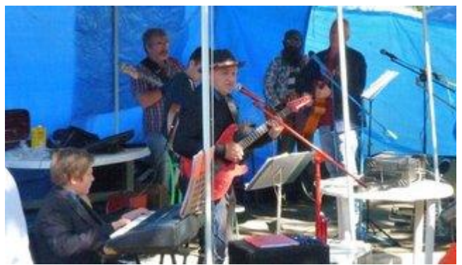
Entertainment by Fiddlers Inn -