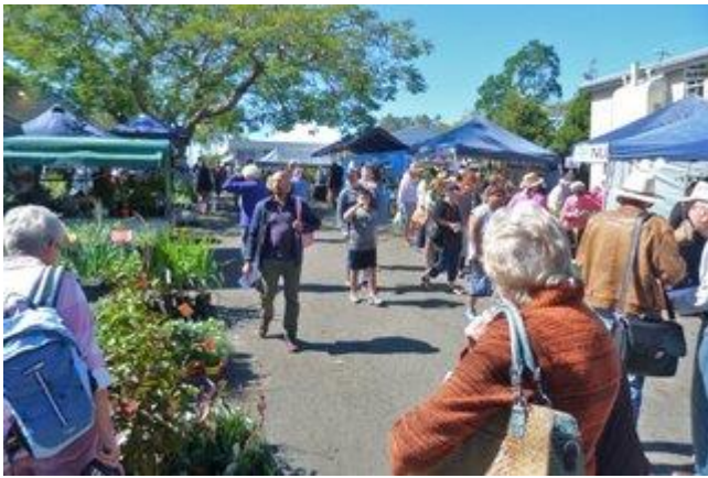
Crowd in one section of the grounds -