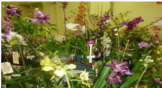
Thank you to all who helped in any way to make this the success it was.