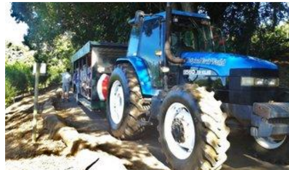
It was a nice sunny day to be on the farm amongst the abundance of Fruit. Dragon Fruit was also growing well with plenty to buy from the Shop.

Our Next stop was at the "Tropical Fruit World" for lunch and a trip via their carriage mover through the farm to view the Fruit Trees and taste some of the fruits.