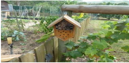
Insect Box in the Yatala Garden -

CATERING AT MT COOTHA - on the 21/22 May we did the catering for the Brisbane Plant Fair, which was a great success.