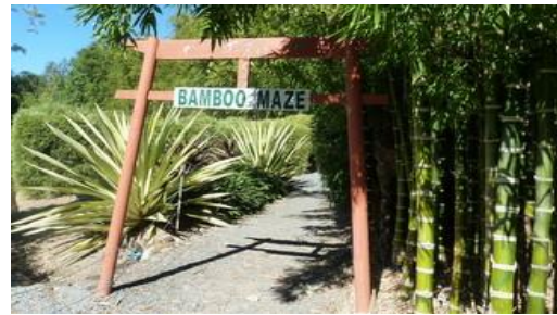
The Bamboo Maze was another interesting feature at "Bamboo down Under".

Our Next stop was at the "Tropical Fruit World" for lunch and a trip via their carriage mover through the farm to view the Fruit Trees and taste some of the fruits.