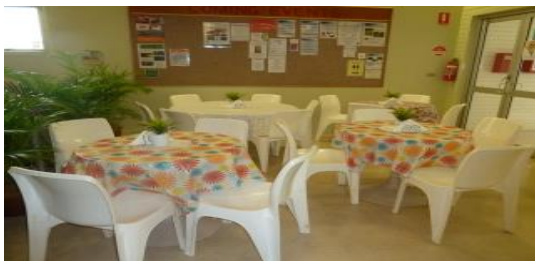
There were some wonderful plants for sale. A Garden's Paradise.